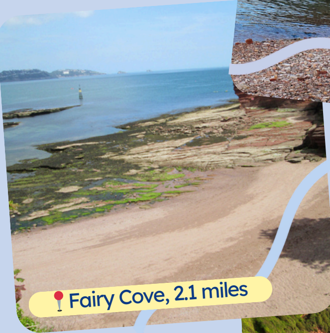
📍 Fairy Cove, 2.1 miles