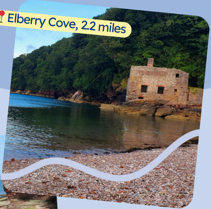
📍 Elberry Cove, 2.2 miles